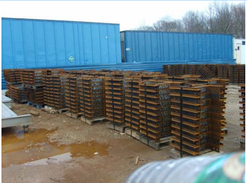
High volume – H Brackets before coating application