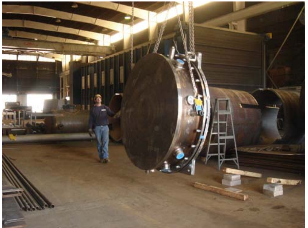
Overhead cranes make easy handling of large scale projects