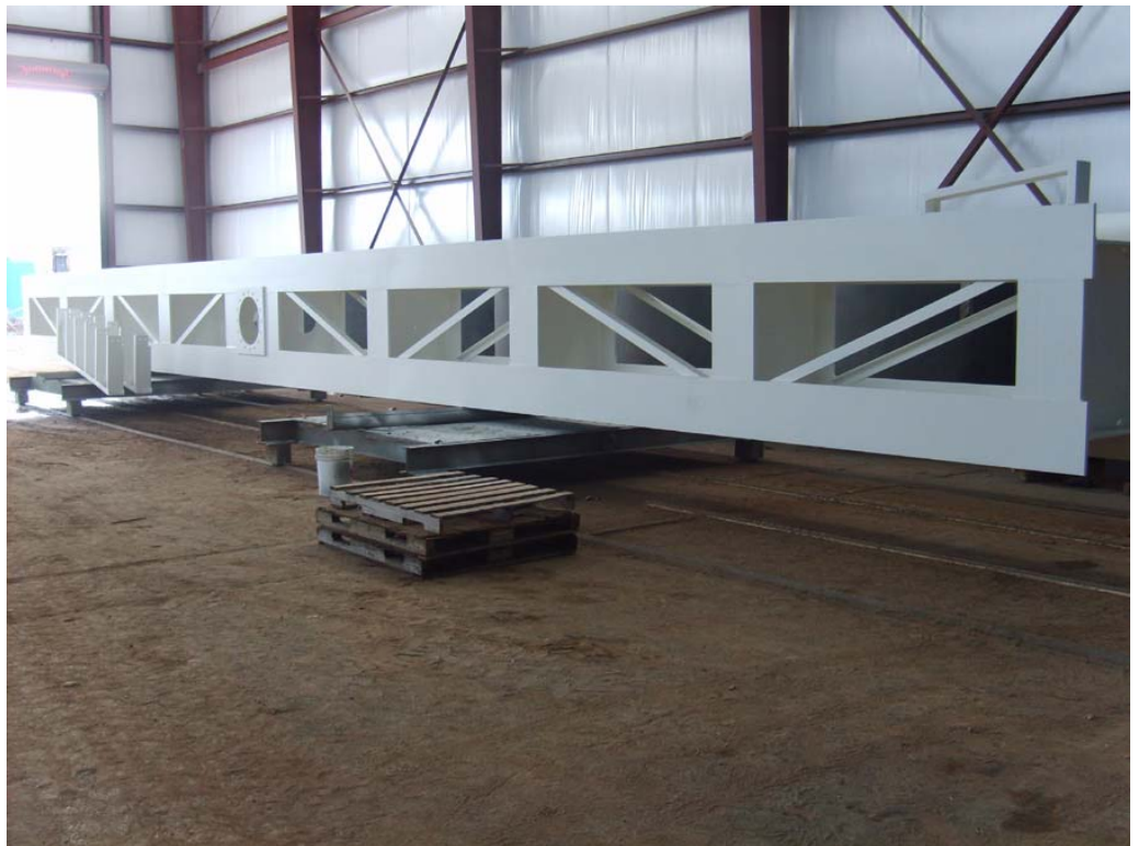
Large Scale – 60 Foot Mixing Support For Open-top Tank

CPMP has expanded their facility to 35,000 square feet. A 2 nd blast room is now being added, which will measure 55 feet long by 19 feet wide and 20 feet high! We are now able to accommodate high production projects as well as a greater volume of large-scale projects. Carney's Point Metal Processing is not limited by the size or scope of the projects.