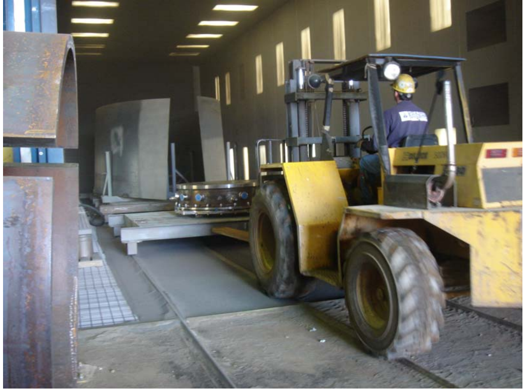
Maneuvering large pieces into the state-of-the-art blast room

Remember, our facility operates in all seasons and weather.